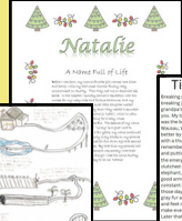
Tika, My Treasure